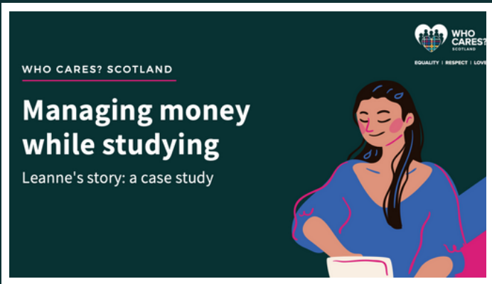
Managing money while studying (SAAS Case Study)