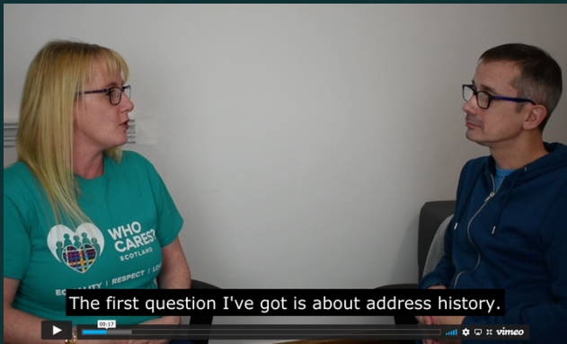
Care Experience and Disclosure - Q&A Video