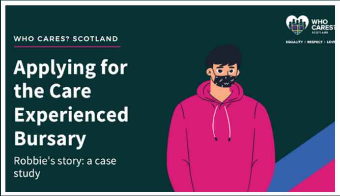
Applying for the Care Experience Bursary (SAAS Case Study)