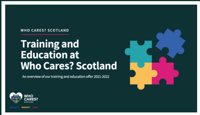
Our Training Offer Pack for 2021/2022

We have been busy producing some new digital learning resources which we hope will be useful for Corporate Parents. We have also updated and repackaged some of our existing resources, creating short thematic clips with subtitles. Click each image or the button below to view the resource.